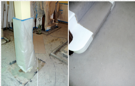
Removing defect screed protecting and reinstating with fibre screed.

Floor preparation, repairs, concreting, screeds and coatings using a wide range of equipment and the most up to date floor repairing methods and materials.