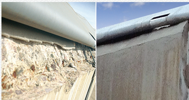
Precast Concrete panels with exposed reinforcement treated and repaired to original.

Before commencing any project, our management team will visit site and assess the safest and most efficient means of completing the works. We produce complete Method Statements and Risk Assessments for all projects, as this is part of our Health and Safety policy along with material data & safety sheets.