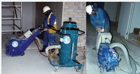
Floor scabbling high uneven surfaces using the blastrac system & floor shot blasting to provide a key for toppings.