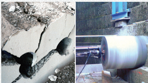
Specialist Diamond Drilling and Sawing services