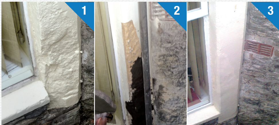
De-laminated & spalled concrete window surround and lintel repairs using a high build repair mortar (1 & 2). Finished window surround and lintel to match existing form and profile (3).

Concrete repairs to precast concrete walls, beams, columns and structures as per clients specifications using a wide range of products from many manufacturers including Fosroc, Weber, Flexcrete, Sika, Tecroc, Resbuild, Paco Systems, Ronacrete and Basf.